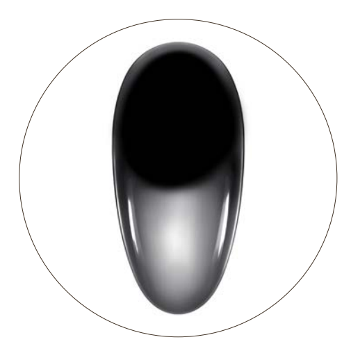
Please refer to METAL finishes for the body